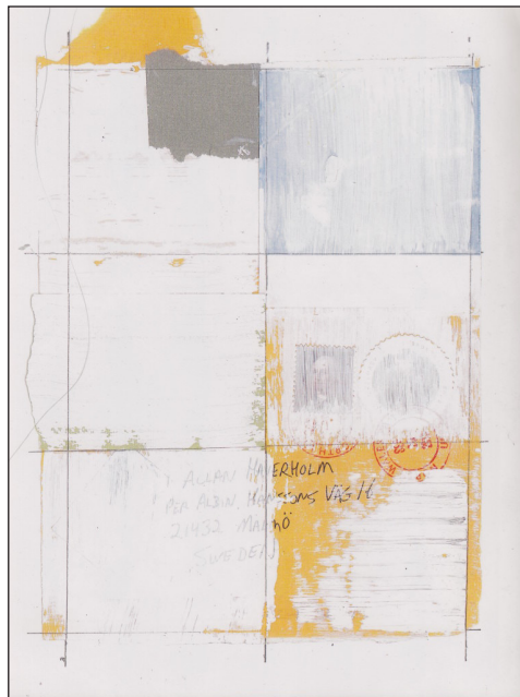
Figure 7: A page from Allan Haverholm's When the Last Story is Told . Haverholm, A. (2015). When the Last Story is Told . Malmo: C'est Bon Kultur. © 2015.

Funnily enough, we can turn to abstract comics to see the real power of the grid's enframing. Allan Haverholm's When the Last Story is Told (2015) uses a uniform six-panel grid on every page of the book ( Figure 7 ). In this case, the grid establishes the visual unity of the page. It tells us that each of the images on the page belong