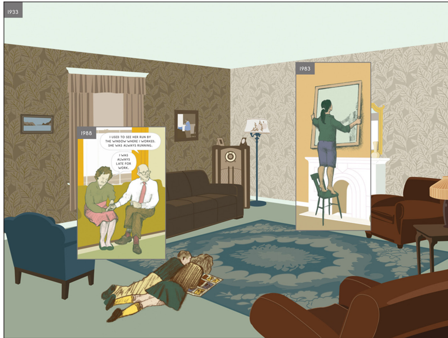
Figure 6: Two-page spread from Richard McGuire's Here . McGuire, R. (2014). Here . New York: Pantheon. © 2014.

More often than not the various frames on any given page relate to each other. For example, superimposed on a background page set in 500,000 BCE, three frames depict a different person who has lost something: a wallet, an umbrella, someone's mind. McGuire's use of the grid subjects memory and history to a reframing of the Gestell that emphasizes extraction; the superimposition of panels 'mines' the scene for past moments, and this mining becomes the narrative. Here correlates these disparate moments to create both juxtaposition and continuity. And, although the book obviously uses synecdoche, the images invoke the whole of time regarding that space. The manifestation of the Gestell in any comic can confound linear sequence and the chronology that goes with it. It makes possible what Groensteen calls 'braiding' (Groensteen 2016), the way that non-sequential panels in different places of the comic evoke each other. In Here , braiding occurs through superimposition, as all times are available at once. We do not have to work our way forward from 500,000 BCE because all times are always already there, at least conceptually.