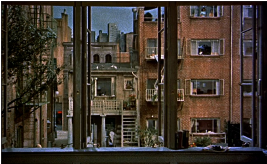
Figure 1: Still from Rear Window (dir. Alfred Hitchcock 1954).

Transitoriness is thus a feature of the grid, moving us along as it organizes space, though not necessarily in a continuous forward motion. The grid operates oppositely to the frame around a painting in that its job is to contextualize a panel among others rather than to isolate a singular work of art from the world around it. Unlike film, which moves its images for us, the comics grid demands the movement of our eyes through and around it for us to make it work. Even though film itself is not obviously delivered by means of a grid, various directors have chosen to manipulate the grid as a means of revealing. Consider Alfred Hitchcock's Rear Window (1954, 2001; Figure 1 ) or the various forms of compartmentalization in Wes Anderson's films, particularly The Life Aquatic with Steve Zissou (2005). While film comes at us, comics