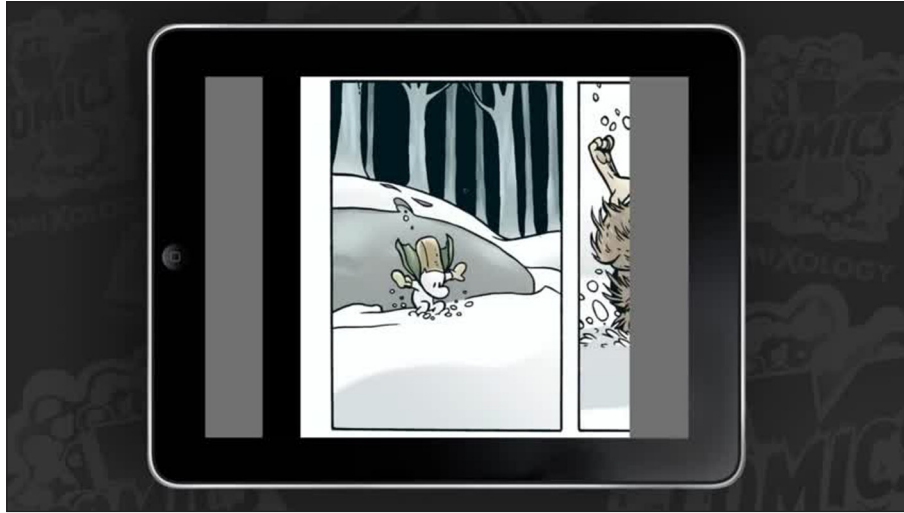
Figure 3: A panel (and two halves) from Jeff Smith's Bone as viewed on Comixology's Guided View™. Smith, J. Bone (1991–2004). Image Comics and Cartoon Books. Bone is © Jeff Smith. 'comiXology' and 'Guided View™' are © Iconology Inc. Comixology is an Amazon.com, Inc. subsidiary.

( Figure 3 ). It is an open question whether these technologies help us to understand comics better, but our concern is how they relate to the grid as a revelatory structure. Clearly they exert pressure to make comics grids more regular, as irregular shapes are less easy to isolate. Manga, which tends to have more irregularly shaped panels can be particularly difficult to read on such systems.