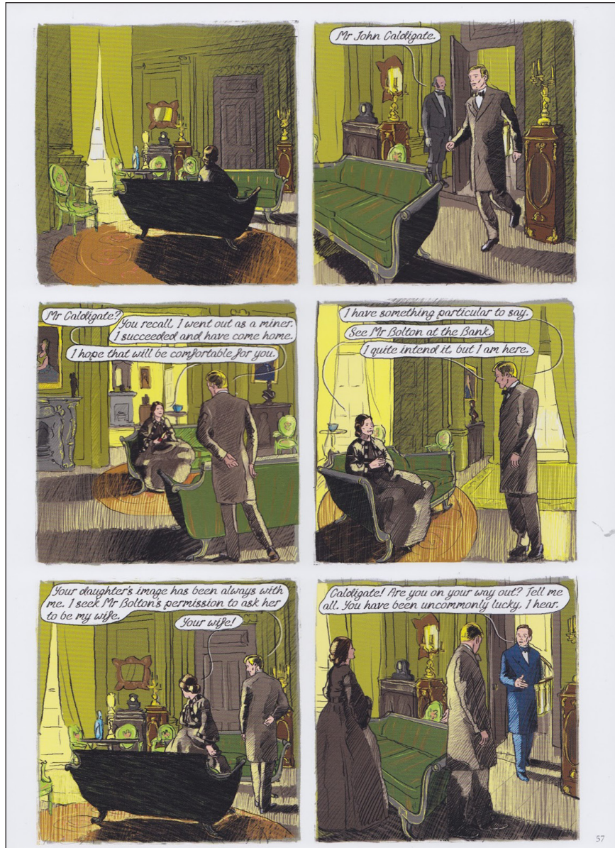
Figure 5: A page from Dispossession: A Novel of Few Words , by Simon Grennan. Grennan, S. (2015). Dispossession: A Novel of Few Words . London: Jonathan Cape. © 2015.

If we read Dispossession on Guided View or Panel Mode, without looking at the grid, just the panels, does this waltz-like structure persist? Or does the relationship among panels that the grid establishes just disappear?