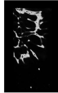
Figure 2: LII Signal from a 5 bar, \phi = 1.8 Iso-octane-Air Explosion Flame [3, 5] (Flame radius \approx 60 mm)

Figure 2 shows processed LII images obtained from soot formed behind \phi = 1.8 iso-octane-air explosion flames obtained from the Shell bomb with an initial pressure of 5 bar [3, 5]. The soot formed behind the flame forms a honeycomb-like structure. A characteristic length-scale defining the soot cell size is observed to be of the order of 5 mm to 1 cm in length.