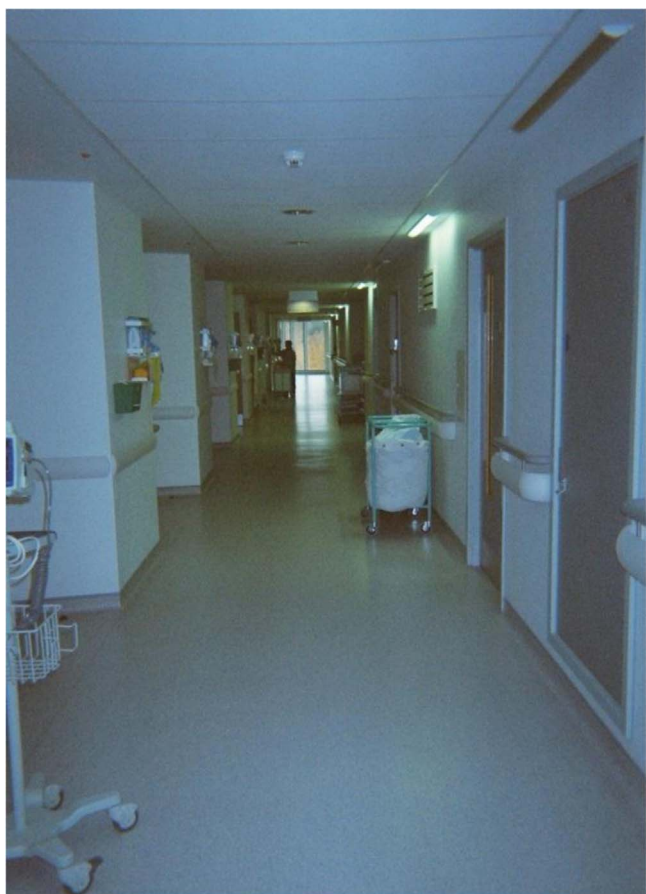
Fig. 4. Surgical ward, post-move.

The examples above illustrate how communication that aims to ensure the needs of patients are met is enabled by a space that allows wide-angle visibility and easy transfer of sound/voice. This corresponds to what Pallasmaa describes as ‘peripheral’, or context-rich, vision in his study of architectural forms (Pallasmaa, 2012). Fig. 3 provides a sense of the view nursing staff had of inpatient beds in the open-plan surgical ward of the old hospital building. The nurse who took this photograph (Fig. 3) said she could sit at the desk (particularly on night duty) and could see all 8–10 patients including those out of this particular shot. By contrast, Fig. 4 illustrates the single room corridor in the new building, with in-board bathrooms highlighting staff’s inability to see and thus check on more than one patient at a time