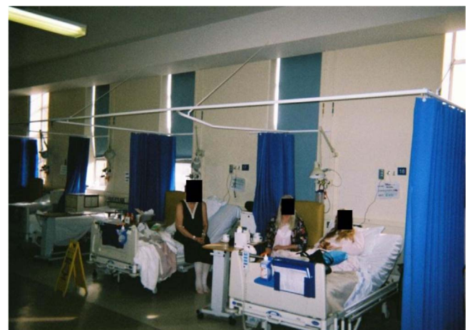
Fig. 5. Surgical ward, pre-move.

The physical barriers to socialisation for patients in the new hospital meant reduced opportunities for patients to help and support each other when staff were not immediately available. Following the move to the new hospital building, a nurse from the surgical ward commented: