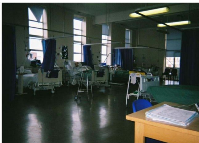
Fig. 3. Surgical ward pre-move.

The examples above illustrate how communication that aims to ensure the needs of patients are met is enabled by a space that allows wide-angle visibility and easy transfer of sound/voice. This corresponds to what Pallasmaa describes as ‘peripheral’, or context-rich, vision in his study of architectural forms (Pallasmaa, 2012). Fig. 3 provides a sense of the view nursing staff had of inpatient beds in the open-plan surgical ward of the old hospital building. The nurse who took this photograph (Fig. 3) said she could sit at the desk (particularly on night duty) and could see all 8–10 patients including those out of this particular shot. By contrast, Fig. 4 illustrates the single room corridor in the new building, with in-board bathrooms highlighting staff’s inability to see and thus check on more than one patient at a time