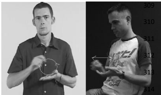
308 Figure 4 Iconic sign repetition

315 Target: TO-WRITE Learner: Handshape and movement error 316 (example from Ortega and Morgan, 2015)