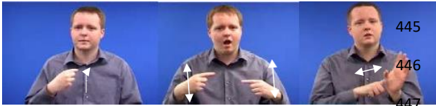
444 Figure 5.

439 to ask learners to copy signs with different levels of phonological difficulty and observe what 440 errors they make. Signs are not all equal in phonological complexity e.g. in the number of hands 441 with which they are articulated (1 or 2), the number of movement components they include, and 442 the motoric complexity of the handshape (Brentari, 1999). See figures 5 and 6 of BSL signs with 443 the simplest to the most complex phonological structure