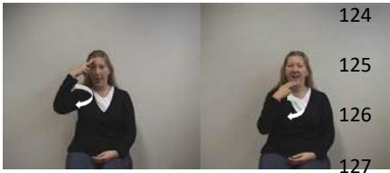
123 Figure 1. Phonological minimal pair in BSL