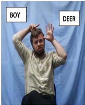
Figure 3 THE BOY SITS UNCOMFORTABLY ON THE DEER'S HEAD

(example from Gulamani, Marshall & Morgan, 2020)