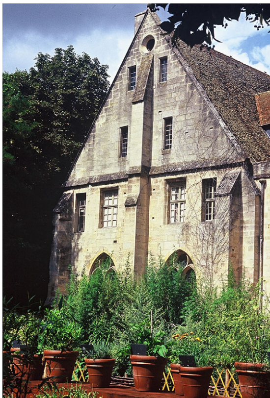
Figure 3 'Table of knowledge'.

These plants are pharmakon , known in various traditions in Europe and Asia as both poison and remedy, plants whose potentially lethal toxicity can also be employed for medicinal purposes. 16 In a balanced dose between healing and fatality lay the potency of the psychotropic 'high': the 'witches' flying ointment' traditionally enabled