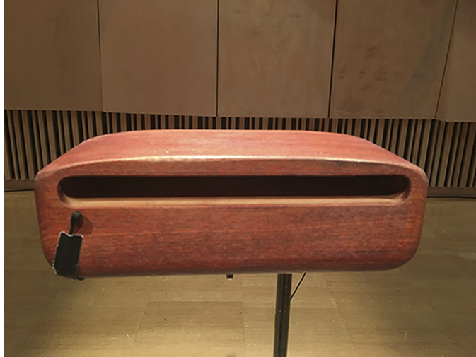
Figure 1 Woodblock. © Liza Lim.

Appearance, behaviour, voice. The woodblock has a mouth (Figure 1). Lim's piece An Elemental Thing (2017) opens with the musician brushing the surface of a woodblock with a double bass bow to create breathing sounds. Later, moans emanate from the wood as a child's rubber ball is skidded across the surface; the sounds then intensify into strange cries with the application of a tiny, buzzing 'bullet' vibrator (Example 1). Over the course of a fifteen-minute piece, that simplest of percussion instruments, a hollow block of wood, turns out to be capable of an operatic expressivity.