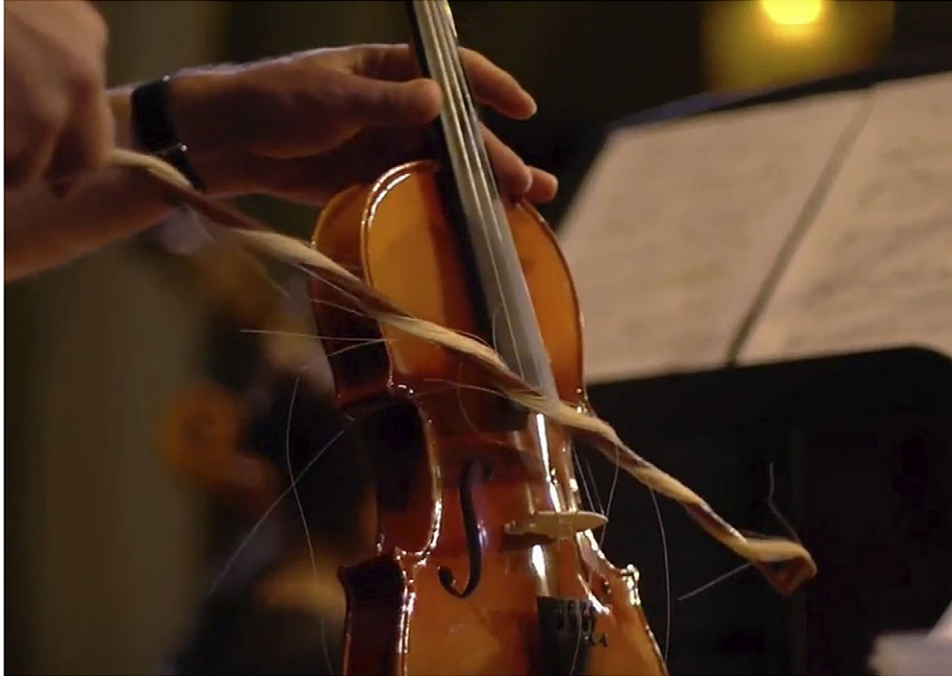
Figure 5 Guiro bow and violin. See video. 31

Appearance, behaviour, voice. This creature is hard to pin down: it is spread out, in-and-amongst, here-and-there. Like others in this bestiary, it is real and imagined: mycelia are simultaneously a type of living organism – a fungal colony that composts other organic matter, sometimes in symbiosis with plants – and an imagined musical entity (and the title of a movement) in Lim's How Forests Think . Its voices are, accordingly, divergent: as organism, it is silent (at least to human ears); as music, its sounds are many and varied. This distributed identity is given life through a series of analogies, which draw likenesses between apparently separate things. First, the collectivity of the