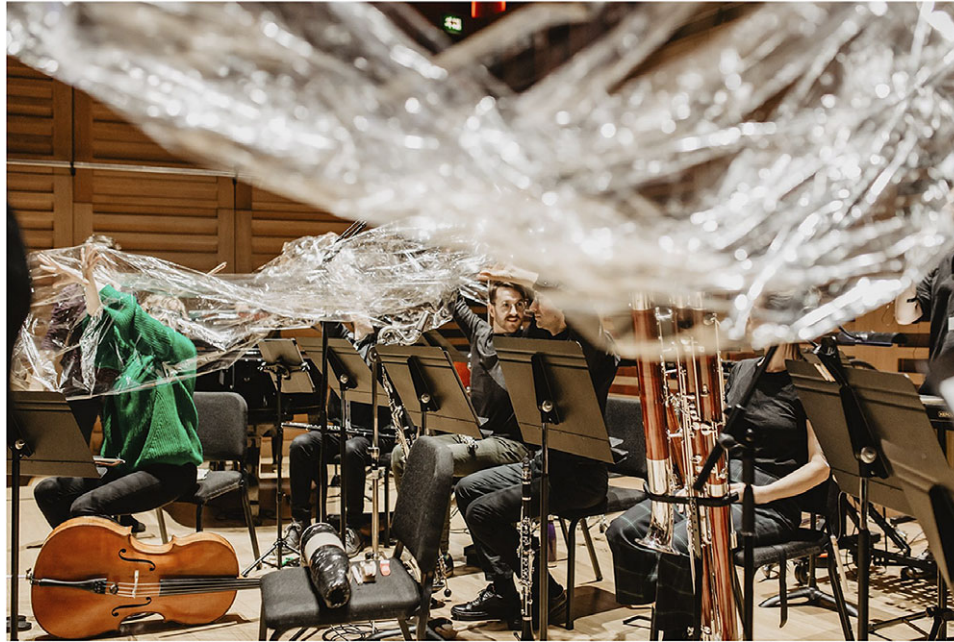
Figure 4 Arrival of the plastic. Rehearsal of Extinction Events and Dawn Chorus . Riot Ensemble, Kings Place, London, Feb. 2020. See video. 24

Appearance, behaviour, voice. After around six minutes of music, the violinist brings a huge, rustling sheet of cellophane from the back of the concert hall onto the stage – they have the choice to drag it or wear it as a cape – before passing it over the heads of the other musicians to the percussionist (Figure 4). The intrusion of this noisy ‘found object’ into the piece is a compositional anomaly, a moment of theatre in an otherwise standard concert performance (afterwards, the plastic joins the other instruments as a sound-producing device, becoming another