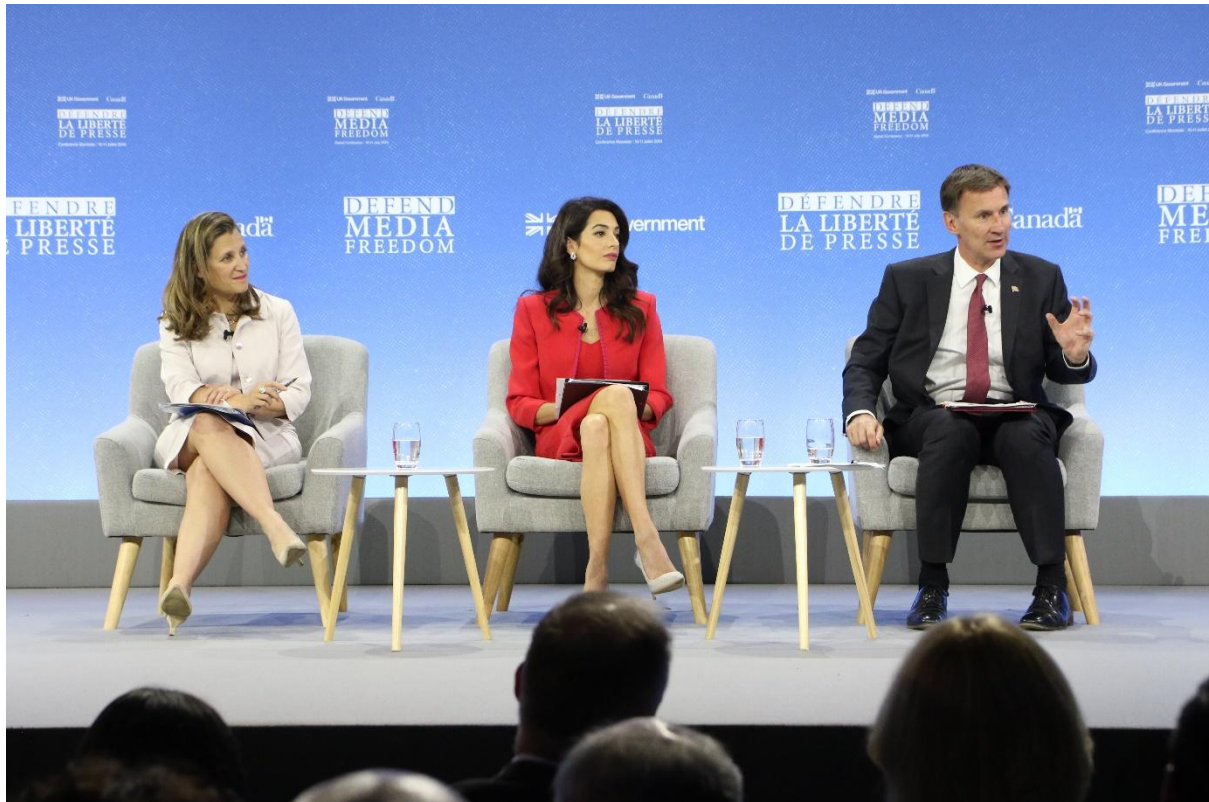
Chrystia Freeland, Amal Clooney and Jeremy Hunt at the launch of the MFC at the first Global Media Freedom Conference in London, July 2019