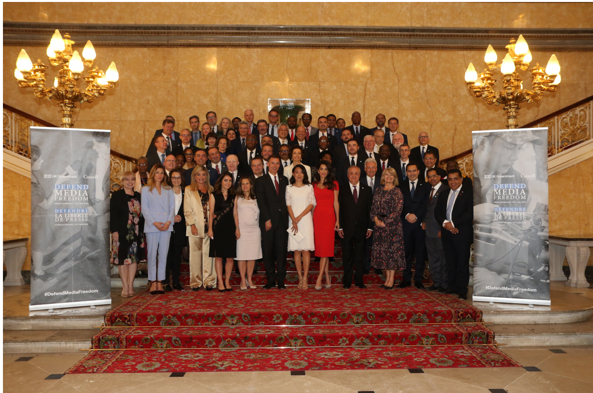
Lancaster House at the first Global Media Freedom Conference in London, July 2019