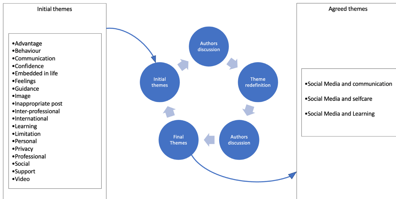
FIGURE 1 Theme identification process.

themes identified were: SoMe and communication, SoMe and Self-care and SoMe and Learning (Figure 1).