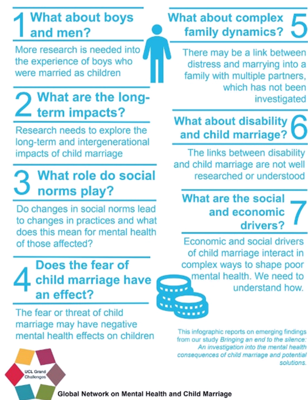
Figure 2. Gaps in the current literature in CM and mental health relationship

The 2h workshop was organized into two sections, lasting 1 h each on the topics ‘Reflecting on the relationship between mental health and CM’ and ‘Reflecting on opportunities to address mental health in existing interventions’.