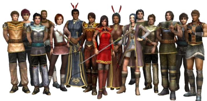
Figure 1. Rainbow SPARX (Smart, Positive, Active, Realistic, X-factor thoughts) characters (the female character dressed in red holding a staff and the male character immediately beside her are the avatars).

Perhaps unsurprisingly then, when SGMY reviewing Rainbow SPARX (in its original format) in 2017 in the United Kingdom were asked if they would use the intervention if they were feeling down , only 38% (8/21) of participants indicated that they would do so [33]. This was among a sample for an exploratory qualitative study where 86% (18/21) of participants reported that they had felt down or low in the past (ie, they were ideally placed to assess an intervention for mild to moderate depression in SGMY) [33]. Given this feedback, we have decided that our new toolkit will not be an adaptation of an existing mainstream program such as SPARX, but instead it will be entirely rainbow in its focus. The PRIDE toolkit will be designed together with SGMY at the forefront, in an overdue effort to meaningfully center those who have been marginalized in terms of their mental health needs. Rainbow SPARX was designed with SGMY in New Zealand and is a fantasy-based serious game. However, consultation sessions with SGMY in