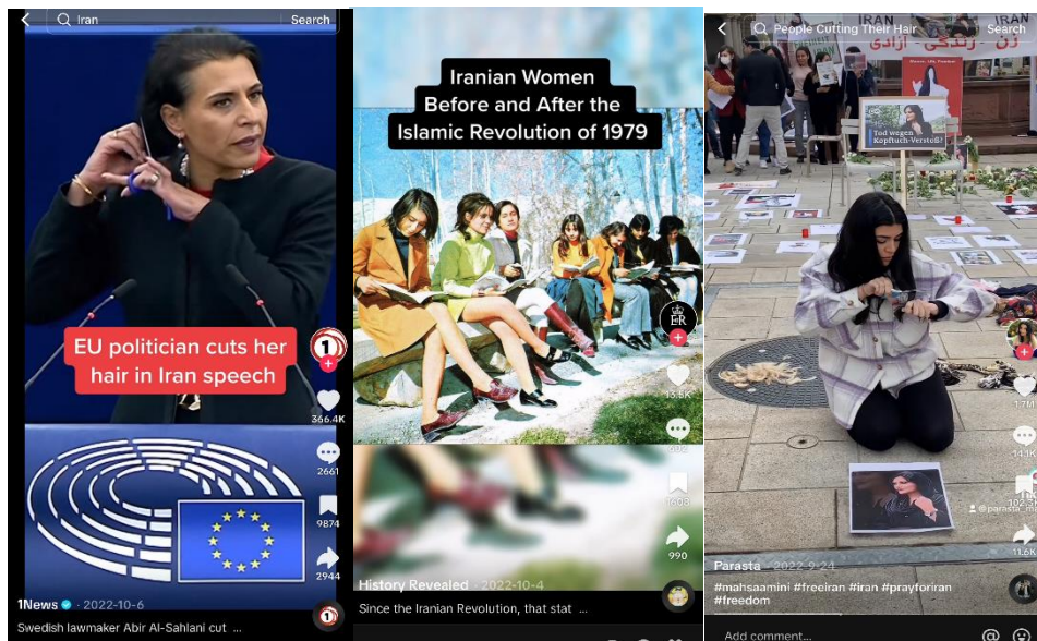
Figure 2: Examples of TikTok videos of female politicians and protesters cutting off their hair in solidarity with #MahsaAmini