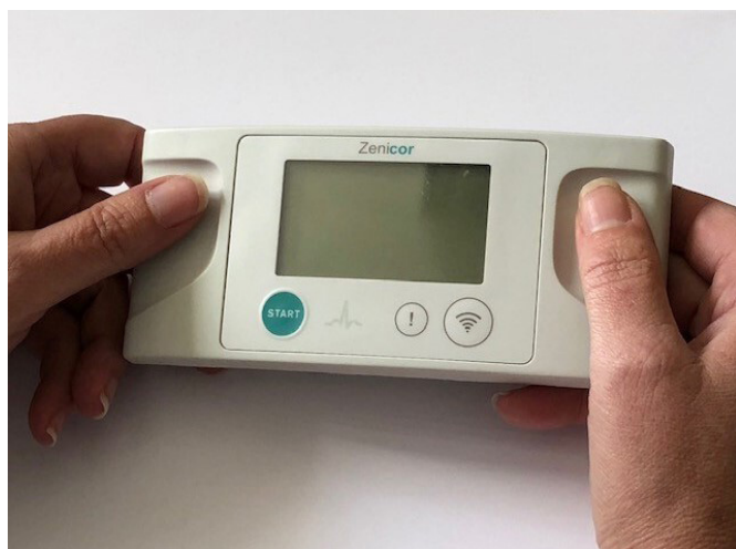
Figure 2 Zenicor hand-held ECG device used to screen for AF in the SAFER trial. AF, atrial fibrillation; SAFER, Screening for Atrial Fibrillation with ECG to Reduce stroke.

For results 1–3 (table 2), the practices will offer participants a consultation to discuss the result and its appropriate management. GPs are not provided with data on burden of AF, so this will not be considered. See figure 3 for a trial schematic. Practices are monitored to ensure that all patients who are found to have AF are reviewed by their GP.