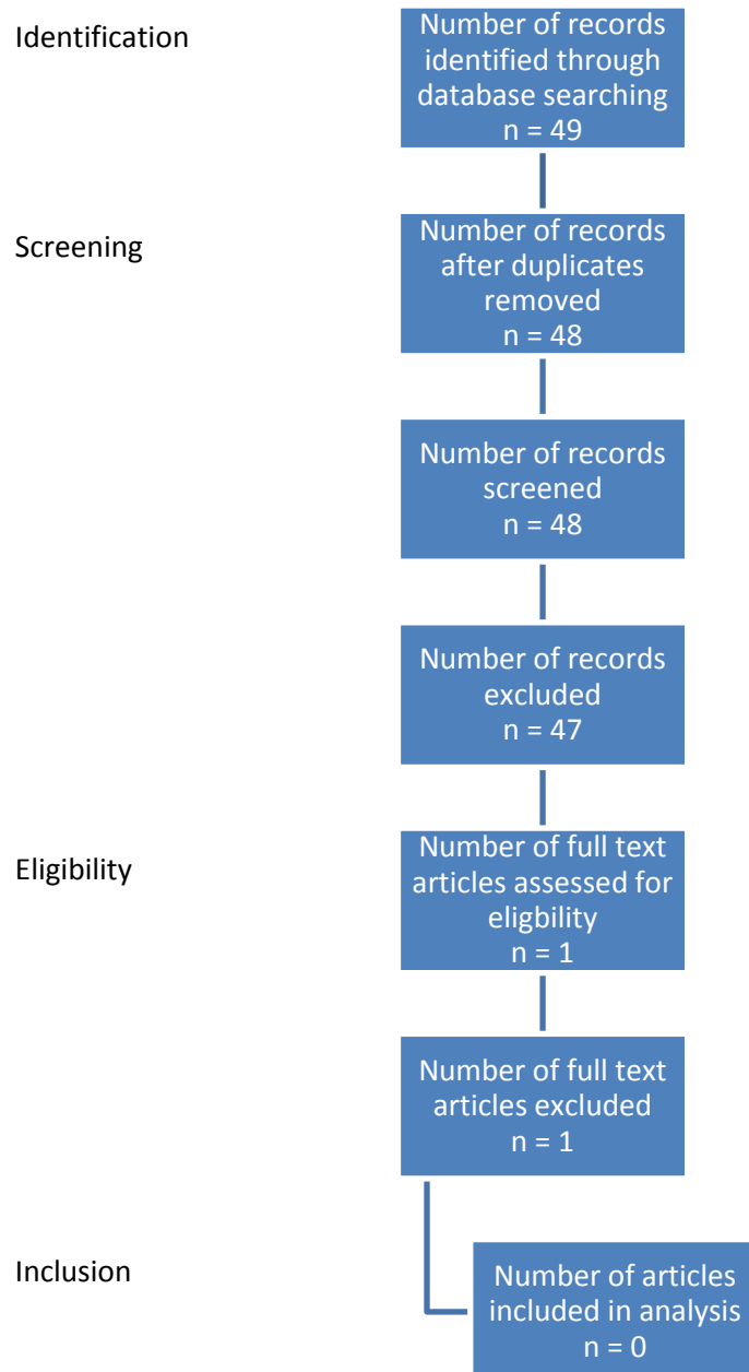
Figure 4: Flow diagram of the literature search process