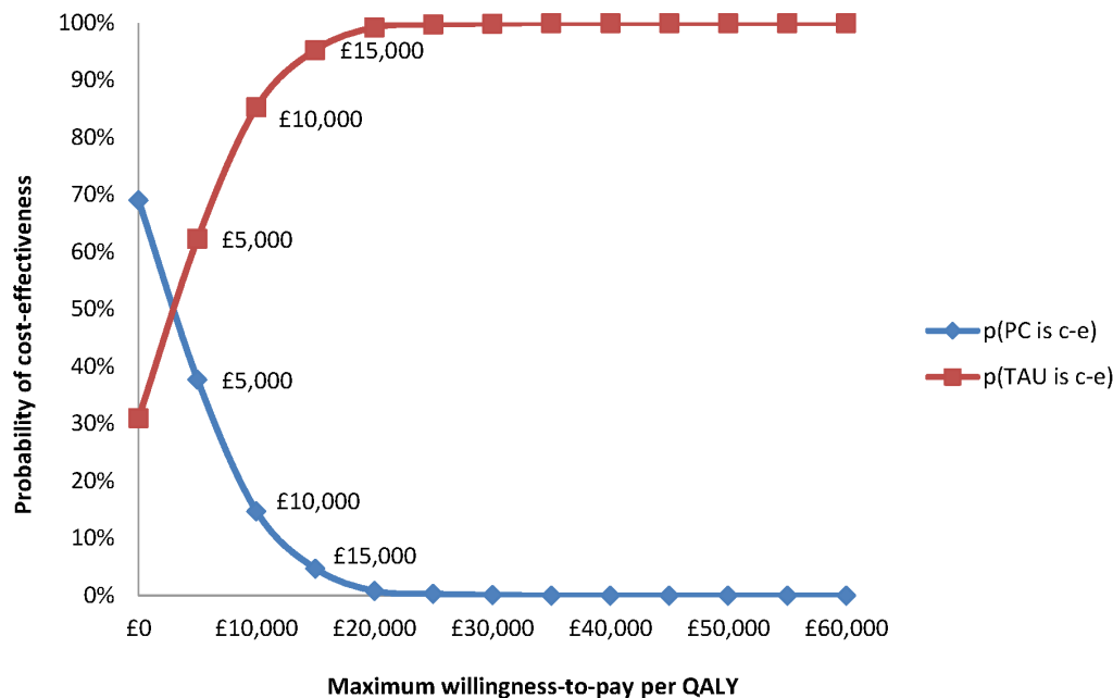
Figure 3. Cost-effectiveness acceptability curves (CEACs) showing the probability that each of the treatment options is optimal, subject to a range of ceiling ratios, which represent the maximum amount society would pay for a one unit improvement in QALYs. doi:10.1371/journal.pone.0098704.g003

on depression over the long term, although this would require a complex trial. Fewer PC compared with TAU participants visited A&E (24% versus 38%), which may indicate increased self efficacy in self management in the PC group, though in a future trial a more robust measure than self report of A&E attendance should be used to examine this, for instance Hospital Episode Statistics (ref health and social care information center)[45].