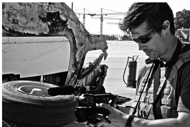
James Foley in Libya, 2011.

Senior Lecturer, City Law School at City University London